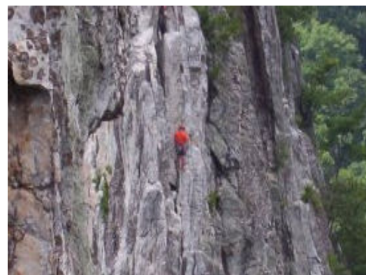
Unidentified rock climber.