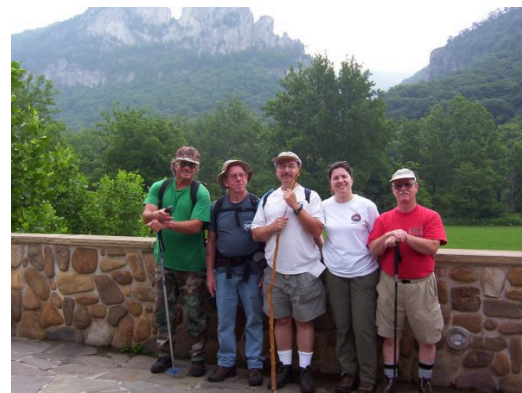
Group pic @ beginning of hike.