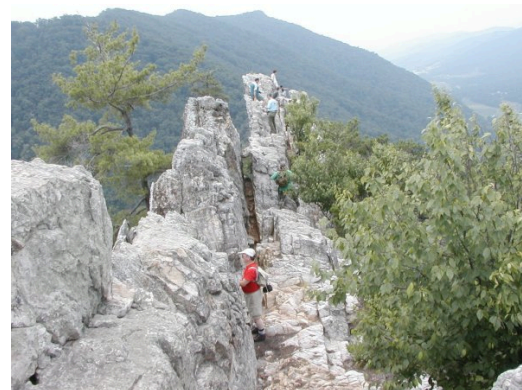
View along top of Seneca Rocks, WV.