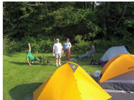
Relaxing at camp.