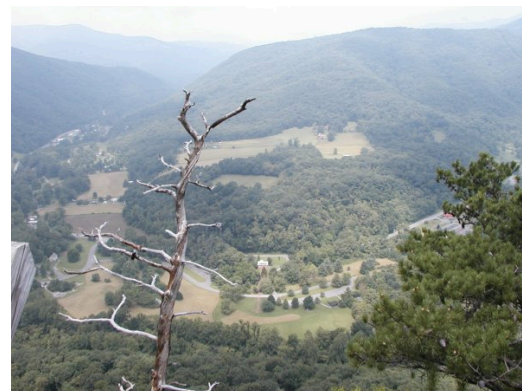
View from observation platform at Seneca Rocks.