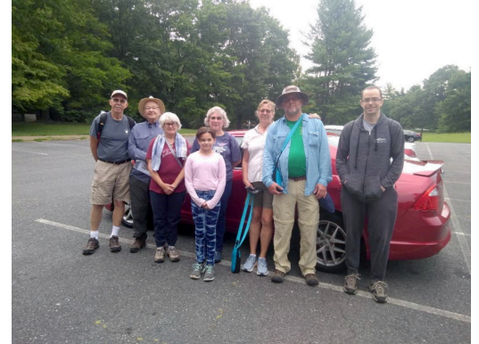
Group pic @ start of hike.

We started the hike around 9:00 AM. We walked past the swimming pool and immediately lost the trail. I asked a gentleman on a mower if we were on the orange trail. He said that he didn't know as he just started working there. So we kept walking and shortly found the trail. We entered the woods and were hiking counterclockwise around the northern area of the park. There were some hills but the