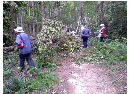
Blowdown within 1st Mile.