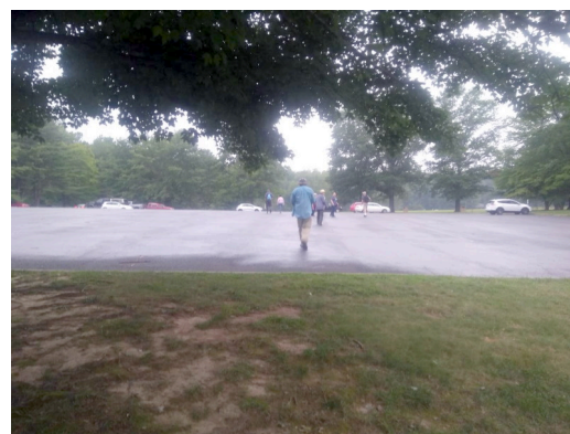
End of the hike.