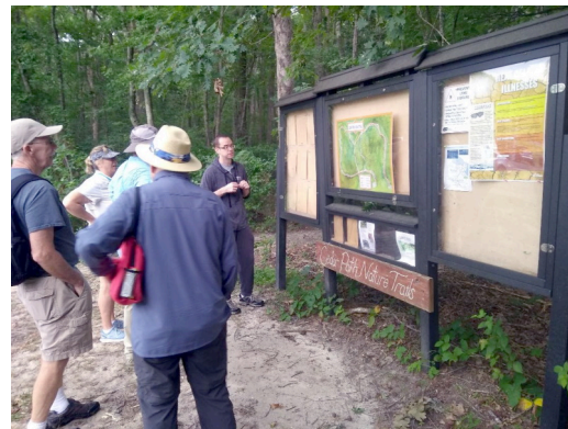
Bulletin Board near Park Office.

The hike ended around 10:30 AM. Thanks to my fellow hikers for participating in this hike today. Nice camaraderie, great trail, perfect length and excellent conversation!