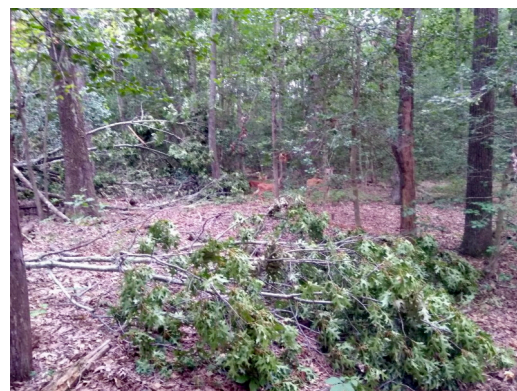
A doe & 2 fawns.