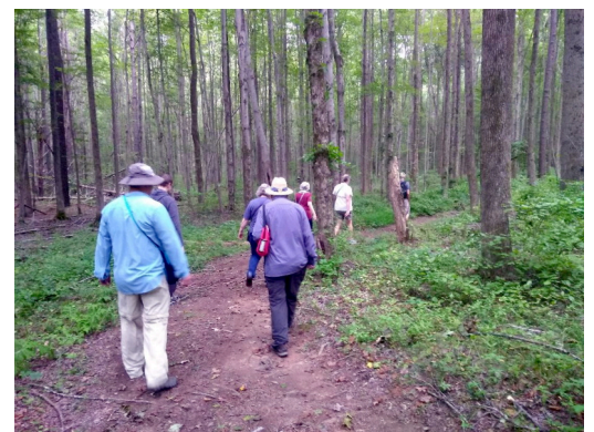
Along the Orange Trail.