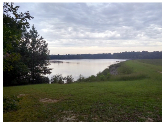
Lake Curtis, VA.